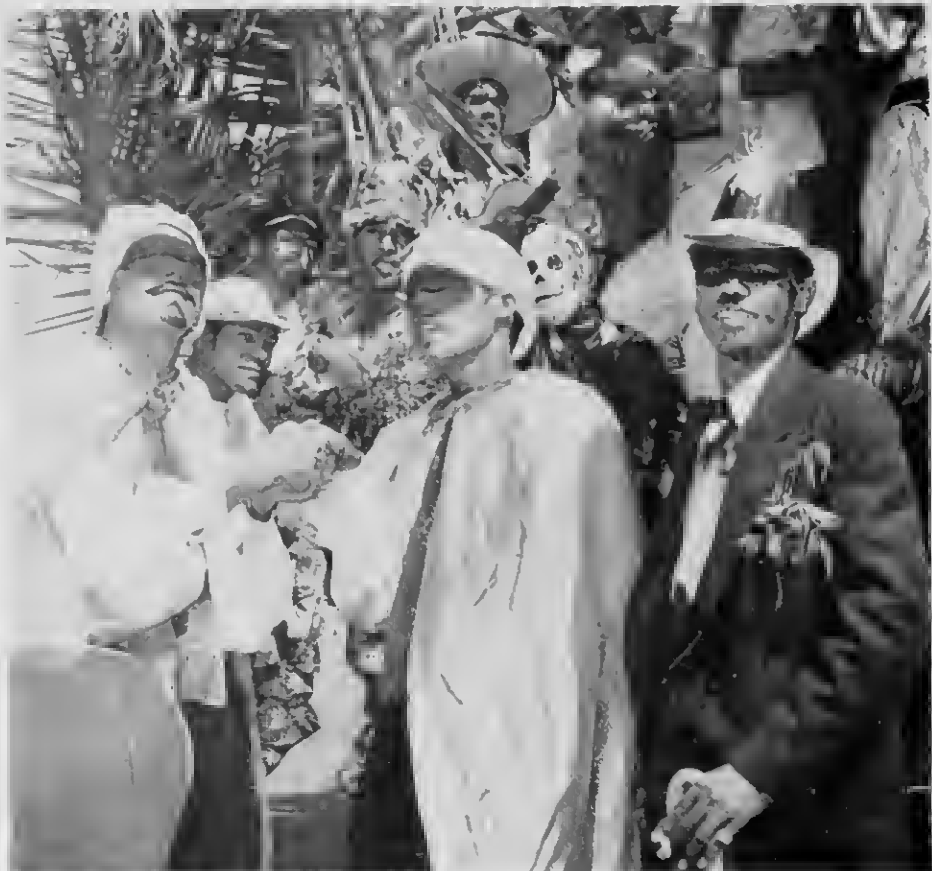
THE FESTIVE doings of a gay carnival group is clearly portrayed in this picture. Joyous figures are they that sing to the music of the guitar and maracas. E ANIMACION festival di un grupo di carnaval alegre ta claramente munstrá aki. Figuranan jubilante ta esunnan cantando ariba musica di guitarra y maraca.